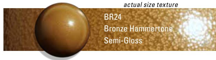
actual size texture BR24 Bronze Hammertone Semi-Gloss

See reverse for additional available Standard Color finishes.