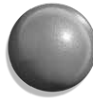
GR05 Silver Hammertone Semi-Gloss