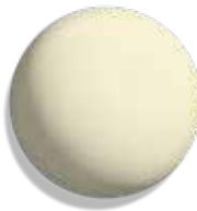
BG38 Beige Hammertone Semi-Gloss