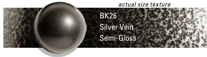
actual size texture BK26 Silver Vein Semi-Gloss