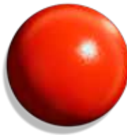
RD15 Red Hammertone Semi-Gloss