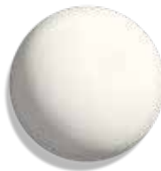
WH260 White Hammertone Semi-Gloss

The two textured finish selections that offer all of the benefits listed above are Hammertone Finish and Leatherette Finish: